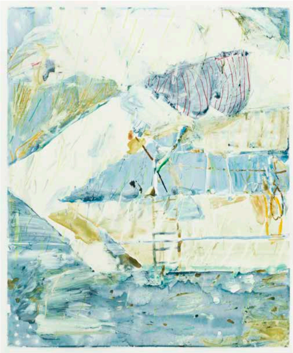
Cerulean Ghost | Water based monotype on Zerkall Intaglio 250gsm | 81,3 x 68,7 cm