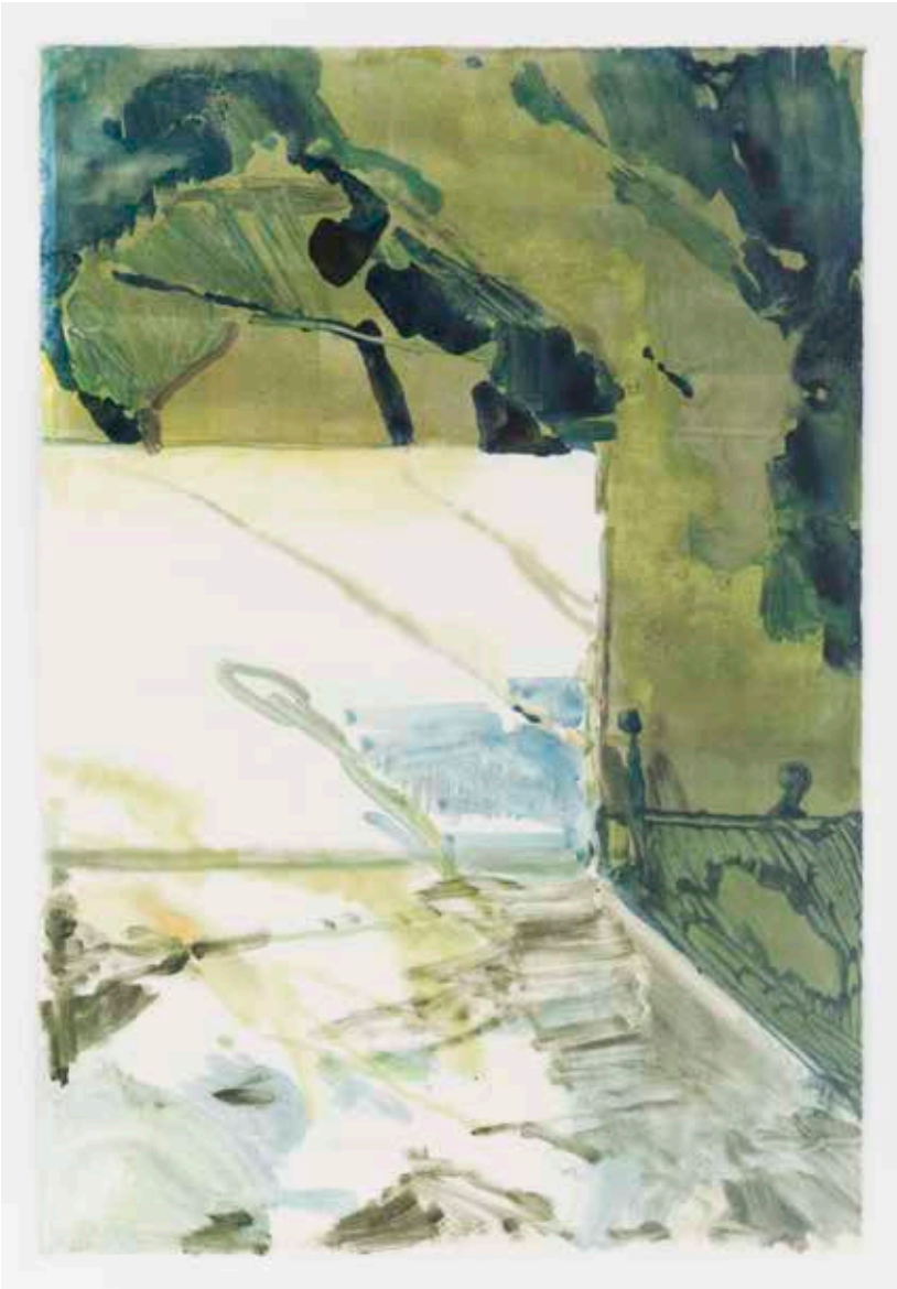
Negative space | Water- and oil based monotype on Hahnemühle Copperplate Bright White 350gsm | 43,3 x 29,3 cm