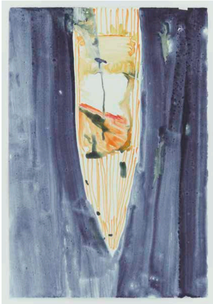
Plain sailing | Water based monotype on Zerkall Intaglio 250gsm | 64 x 44 cm