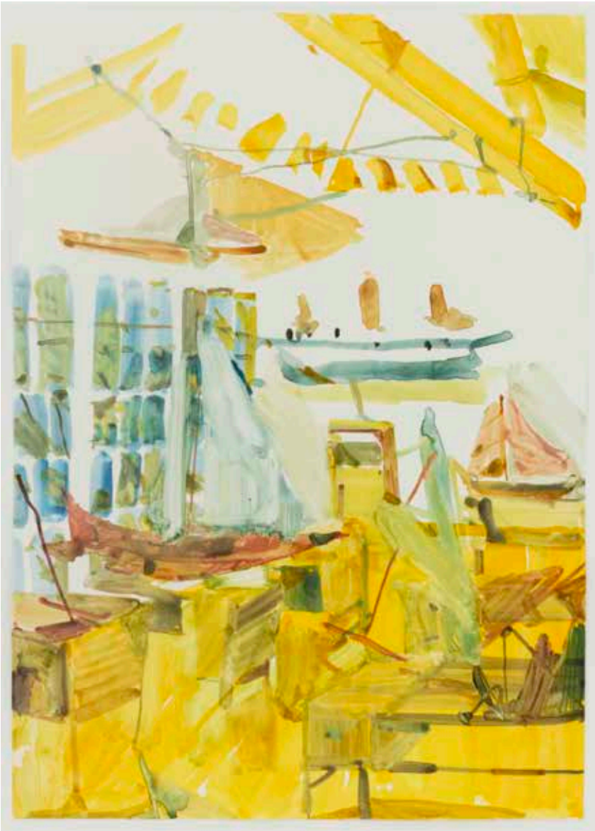
The dreamer | Water based monotype on Zerkall Intaglio 250gsm | 87 x 57 cm