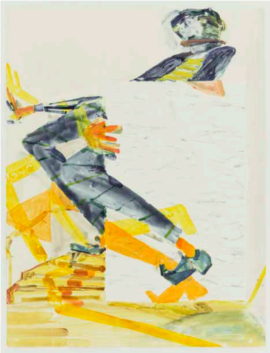
Cracker | Water- and oil based monotype on Zerkall Intaglio 250gsm | 98,5 x 75,8 cm