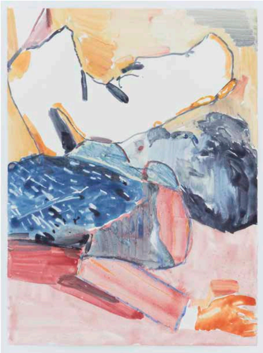
Hooligan | Water based monotype on Zerkall Intaglio 250gsm | 59 x 44 cm