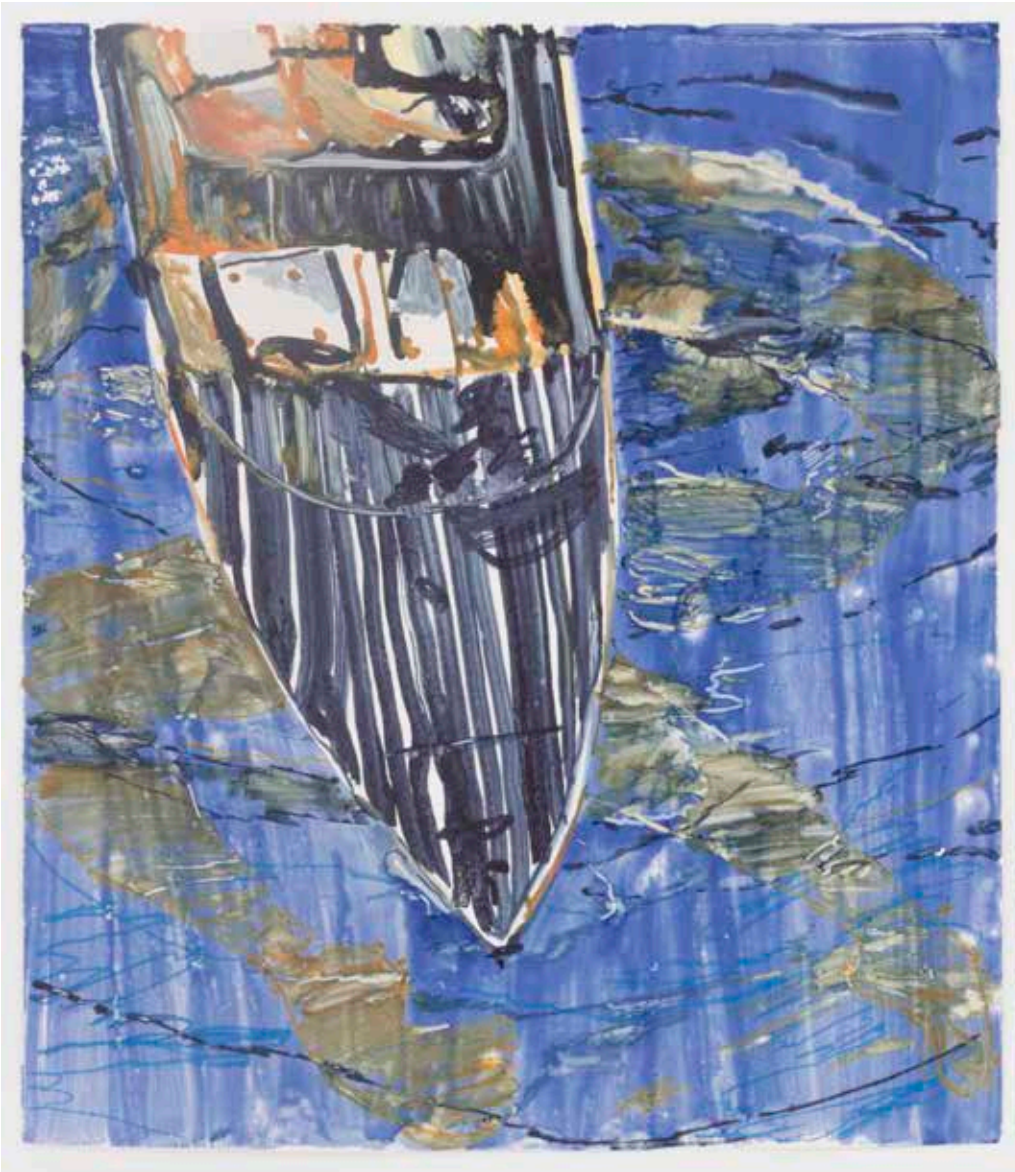
Drown the weekend | Water based monotype on Hahnemühle Copperplate Bright White 350gsm | 81 x 69,5 cm