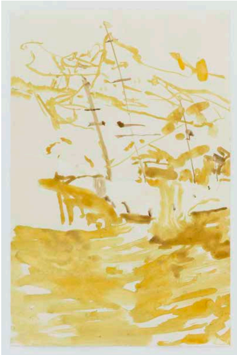
Honeytrap | Water based monotype on Hahnemühle Copperplate Bright White 350gsm | 43,5 x 27 cm