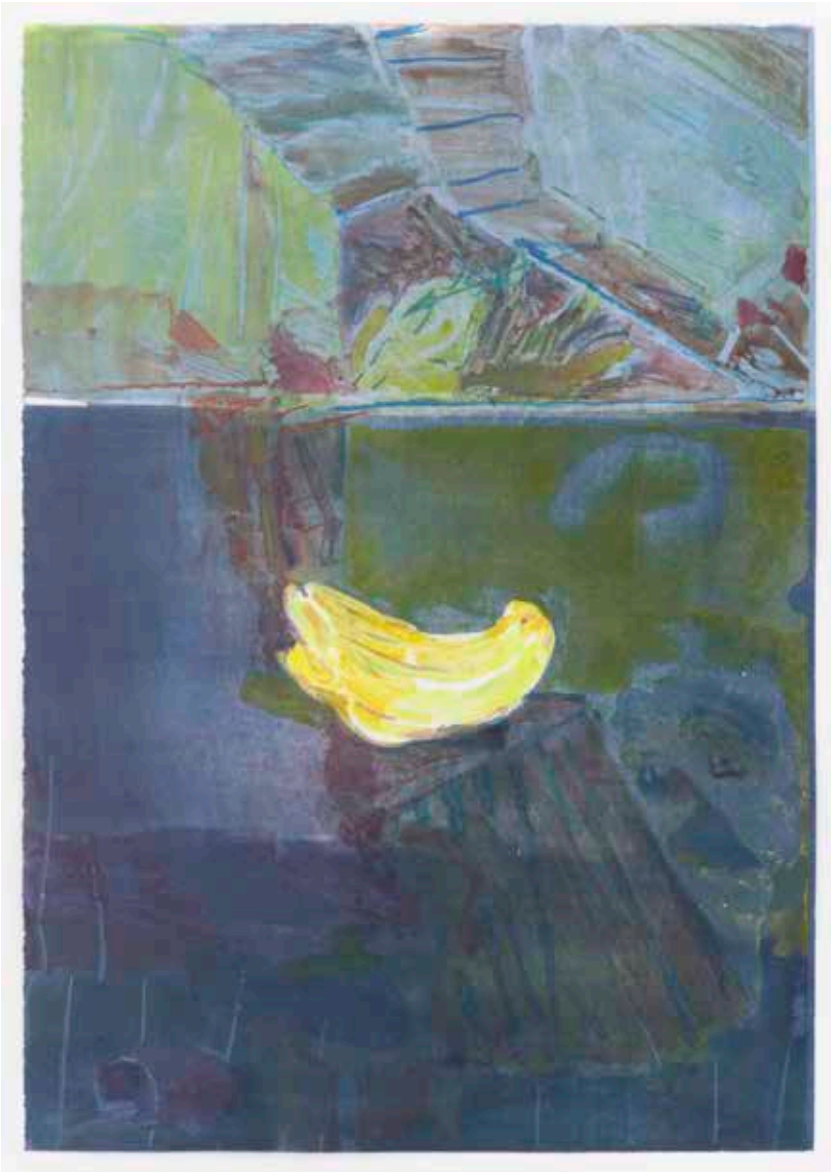
Float | Water- and oil based monotype on Zerkall Intaglio 250gsm | 64 x 43 cm