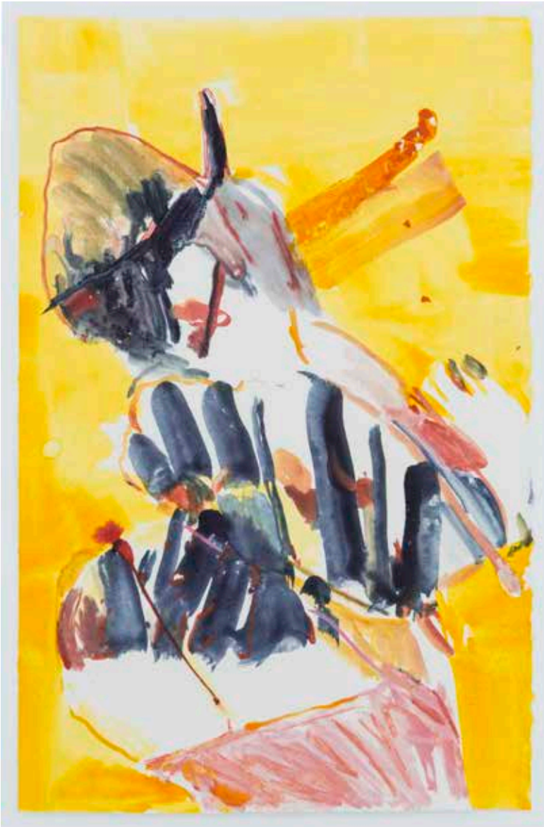
Sweet & sour duck | Water based monotype on Zerkall Intaglio 250gsm | 64 x 41 cm