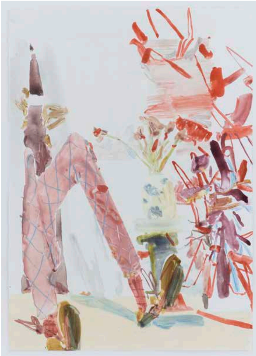
Greeting spring | Water based monotype on Hahnemühle Copperplate Bright White 350gsm | 60,5 x 43 cm