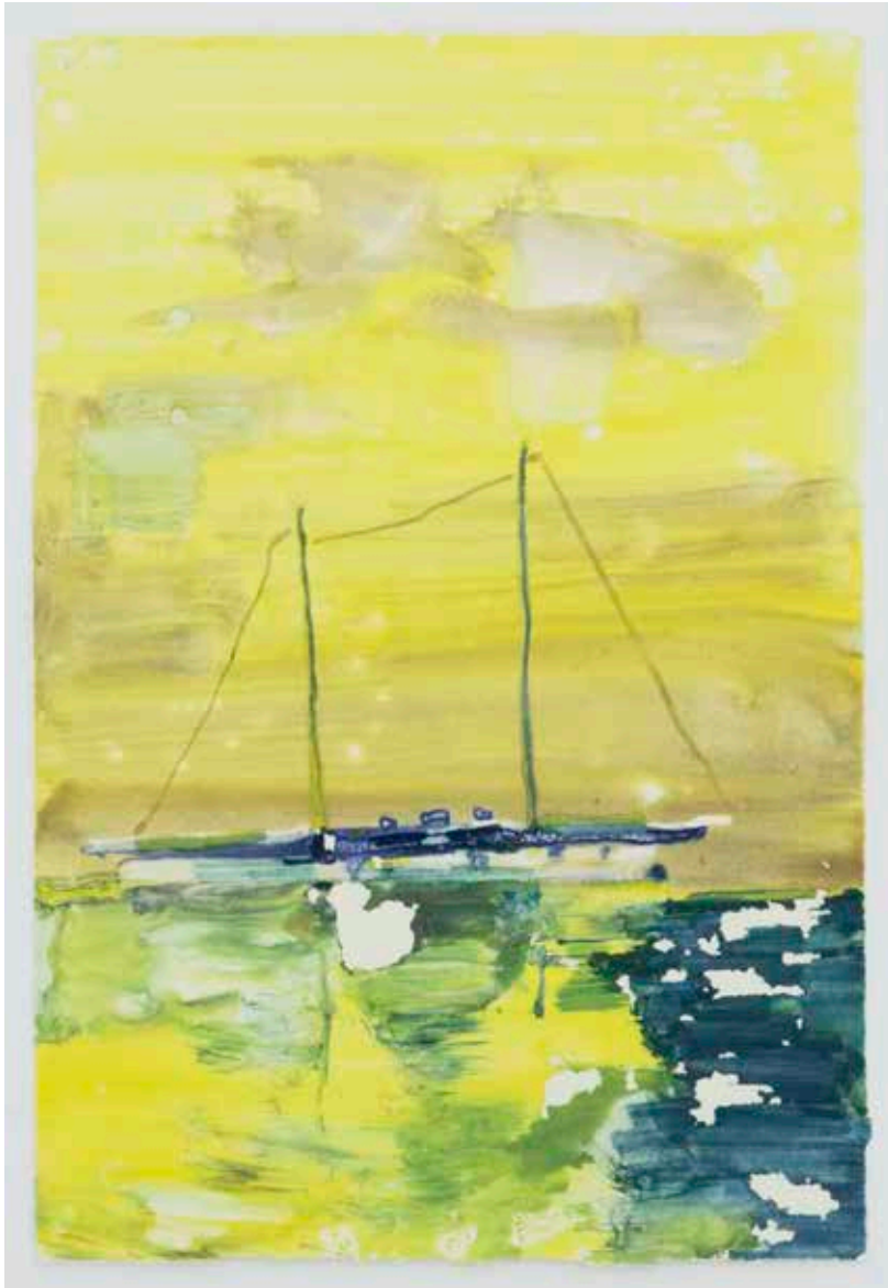
Basking | Water based monotype on Hahnemühle Copperplate Bright White 350gsm | 43,7 x 29 cm