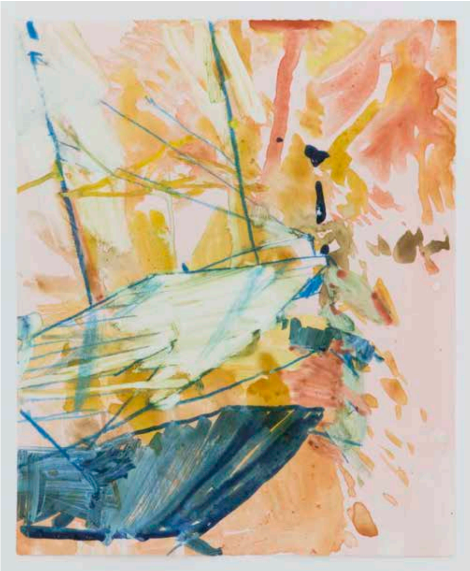
Recreation | Water based monotype on Hahnemühle Copperplate Bright White 350gsm | 40 x 33 cm