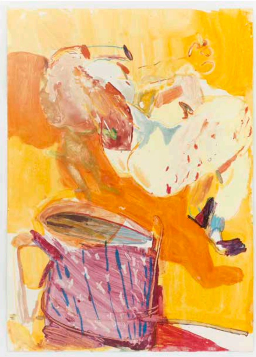
Jolly morning | Water based monotype on Zerkall Intaglio 250gsm | 60,3 x 42,5 cm