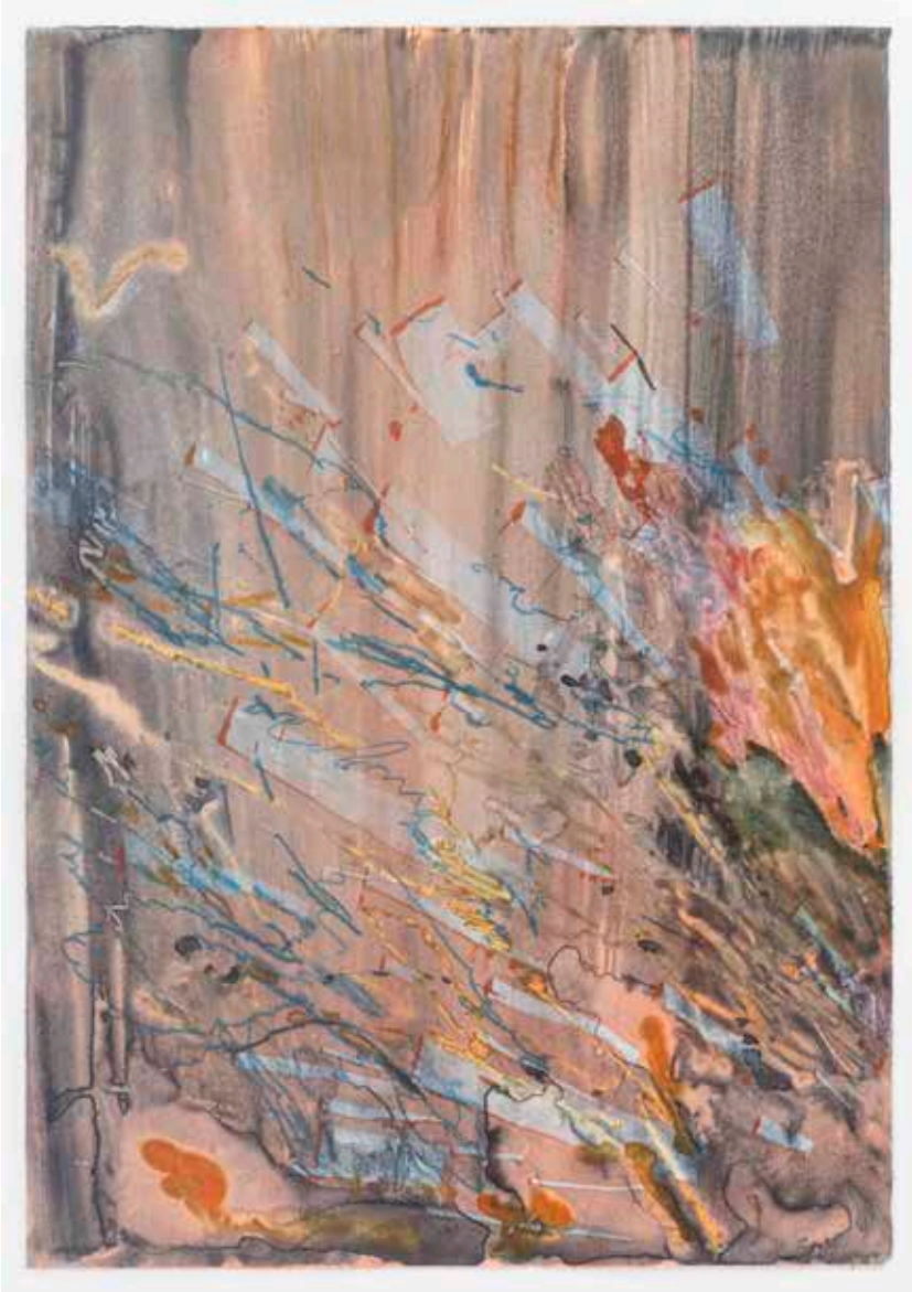
Pressure Cooker | Water- and oil based monotype on Hahnemühle Copperplate Bright White 350gsm | 64 x 44 cm