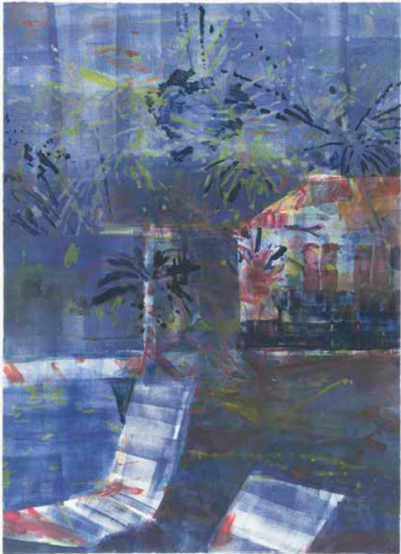
The pot boiler | Water- and oil based monotype on Zerkall Intaglio 250gsm | 80 x 58 cm