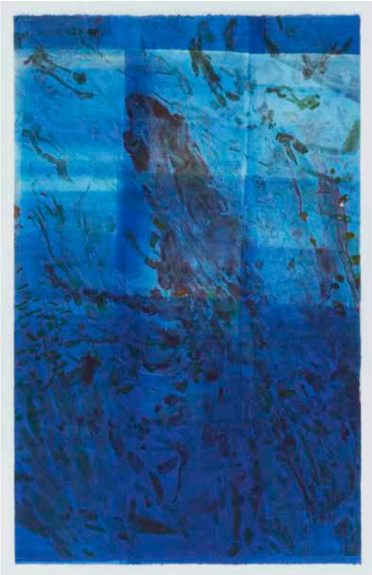
Blue Movie | Water- and oil based monotype on Hahnemühle Copperplate Bright White 350gsm | 43,5 x 27 cm