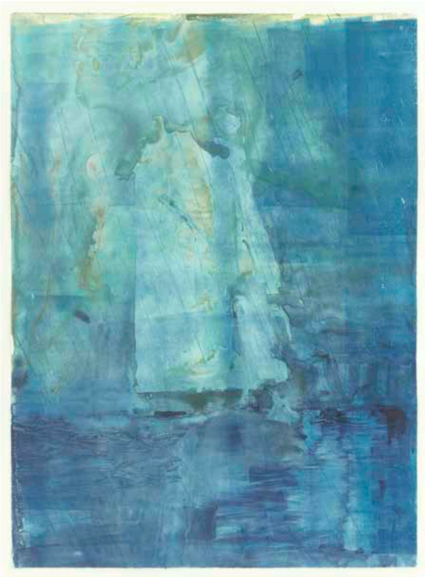
The furthestmost | Water- and oil based monotype on Zerkall Intaglio 250gsm | 80 x 57,7 cm