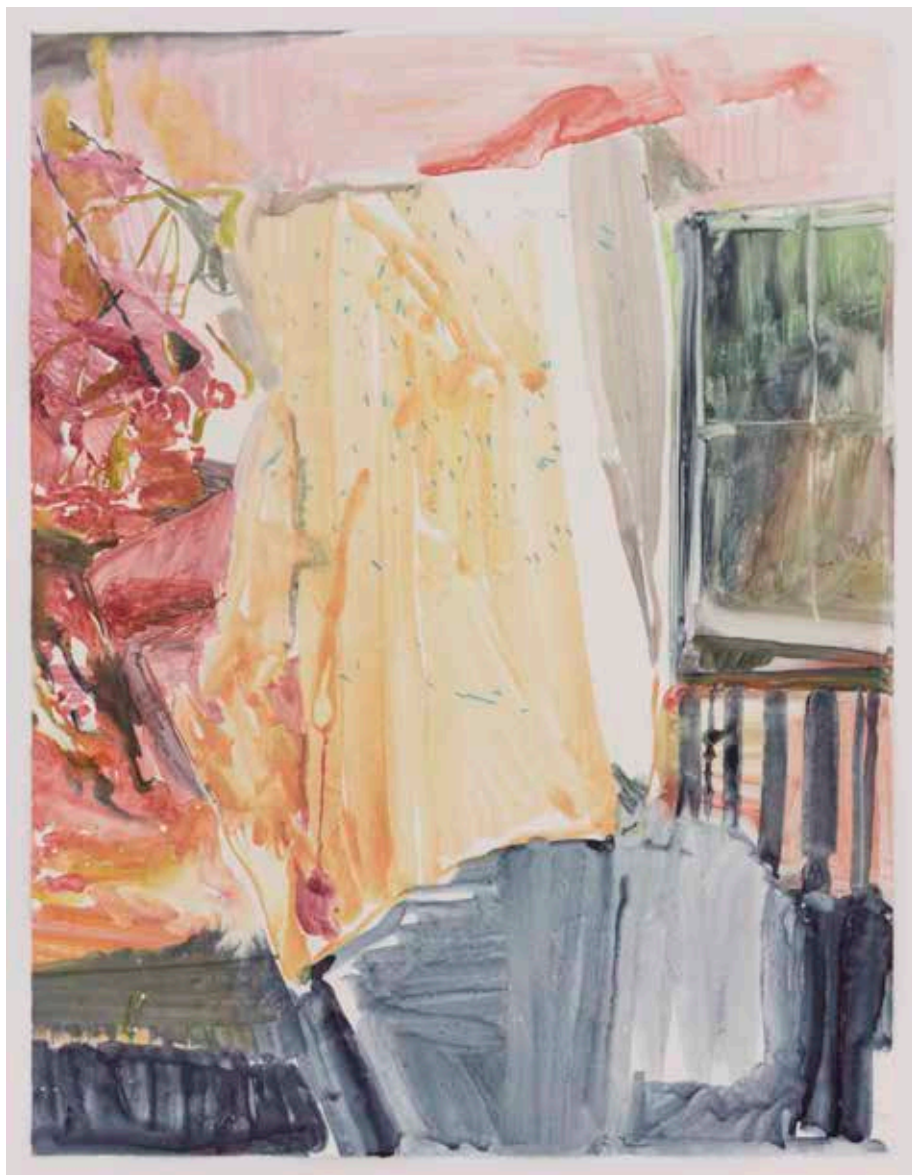
Cabin fever | Water based monotype on Zerkall Intaglio 250gsm | 99 x 75,8 cm