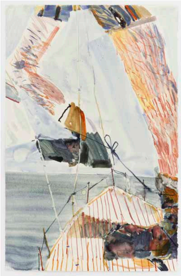
Nowhere bound | Water based monotype on Hahnemühle Copperplate White 350gsm | 60,5 x 37 cm