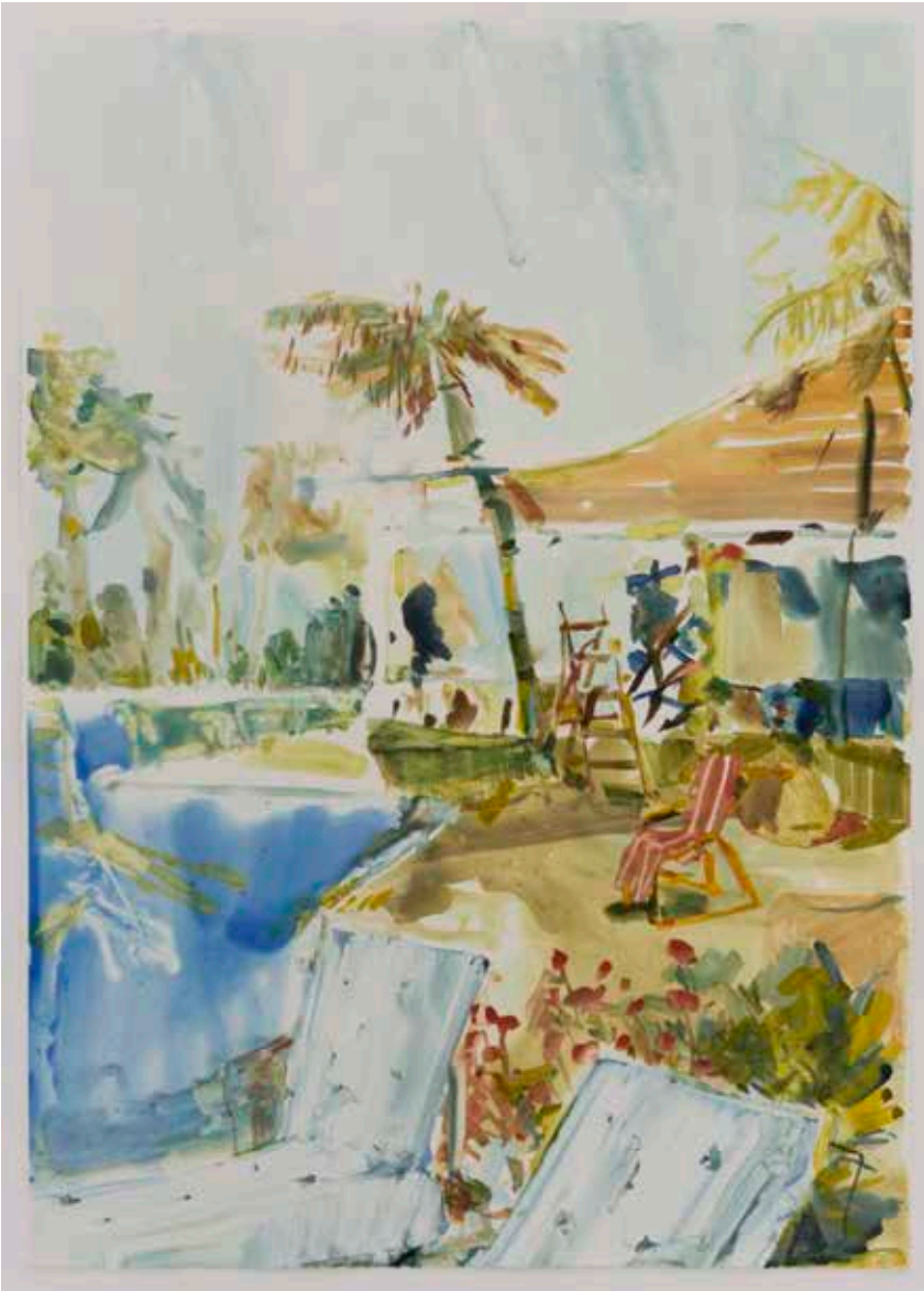
Obvious happiness | Water based monotype on Zerkall Intaglio 250gsm | 82 x 57,7 cm