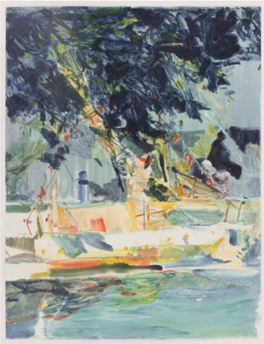
In the navy | Water- and oil based monotype on Zerkall Intaglio 250gsm | 99 x 75,5 cm