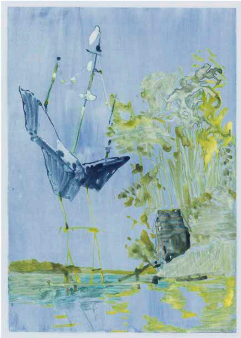
The treasure | Water based monotype on Hahnemühle Copperplate Bright White 350gsm | 63,5 x 44,5 cm