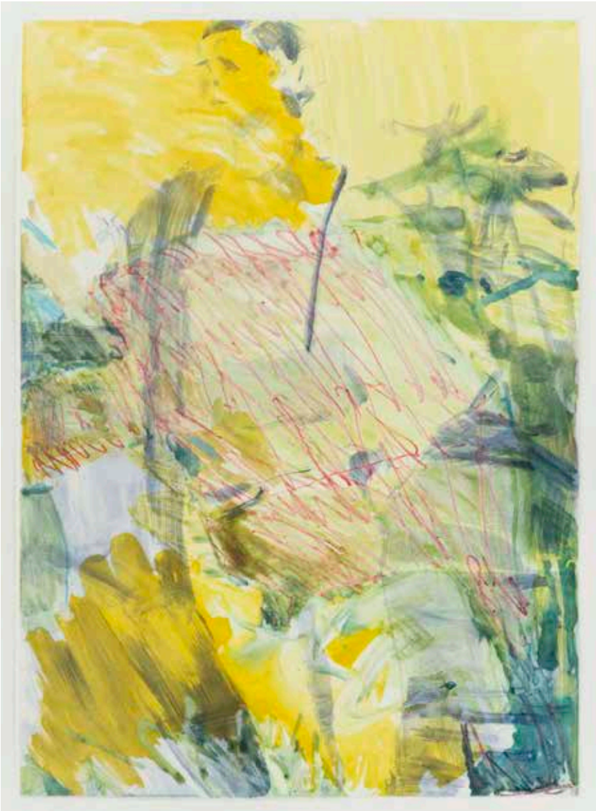
Centipede | Water based monotype on Zerkall Intaglio 250gsm | 60,5 x 43,5 cm